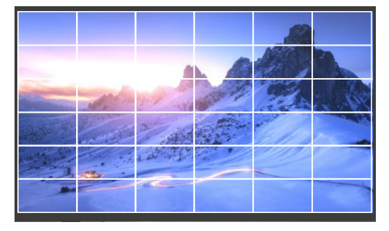
6x6 1.8mm | 162" | FullHD