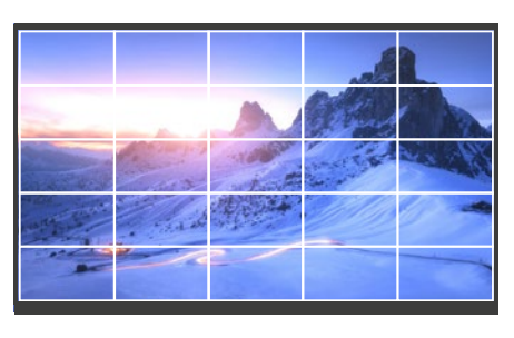
5x5 1.5mm | 135" | FullHD